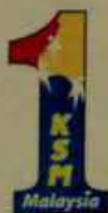
DATO' SRI RICHARD RIOT ANAK JAEM MENTERI SUMBER MANUSIA

“PEKERJA BERINOVASI PEMACU TRANSFORMASI”